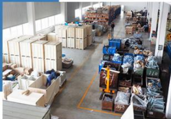
Packaging Workshop ▲

HENGTONG Is located in WUXI, close to Shanghai Port. Our products are exported to Southeast Asia, South Africa, Europe, Canada, Mexico, and America. We are experienced, professional, friendly, and eager to help with any need, from simple to custom manufactured products.