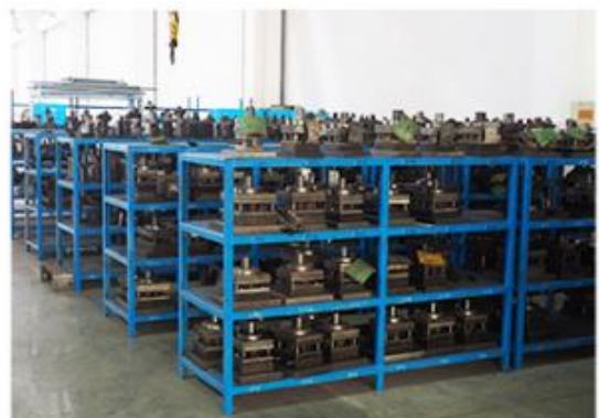
Mold Library ▲