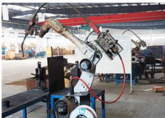
Welding Workshop ▲