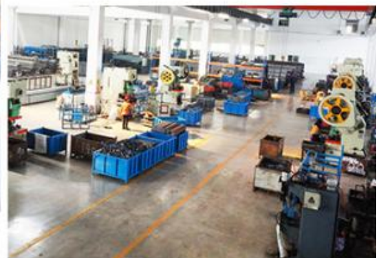
Stamping Workshop ▼